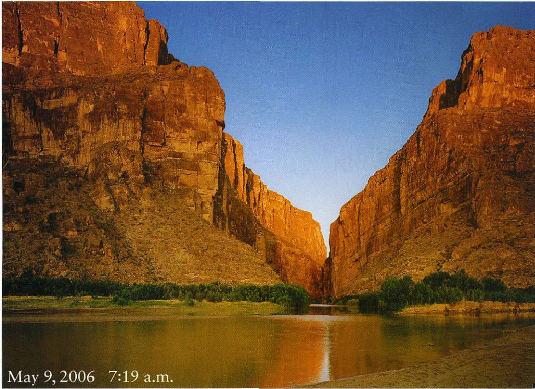
May 9, 2006 7:19 a.m.