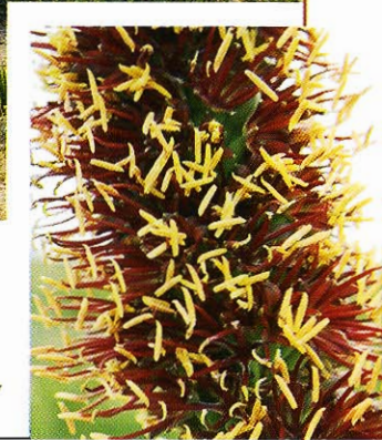
↑ The lechuguilla has to work for many years to produce a giant stalk of flowers, then it dies.